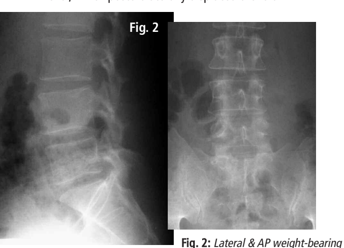
lumbar spine radiographs revealing a mild levorotatory lumbar scoliosis with right lateral flexion and left posterior rotation of L4 upon L5. Note the flattening of the lumbar lordosis with approximately 50% loss of disc space present at the L5/S1 level. These changes are thought to be an antalgic posture. No other signs of degenerative change are seen in the lumbar spine.

During this trial of divergent care, plain film radiographs and MR images of the lumbar spine were obtained. The radiographs were performed in the weight-bearing position and included anteroposterior and lateral projections. They revealed a slight levorotatory lumbar scoliosis and significant flattening of the lumbar lordosis. These films suggest an acute clinical presentation. The disc space at L5/S1 demonstrated approximately 50% loss of height; no other signs of degenerative change were seen (i.e. sclerosis, spondylophytosis) (Fig. 2). The MRI was performed on an upright unit and the images were taken in the neutral seated (weight-bearing) position using standard imaging protocols. The T1- and T2-weighted sagittal and axial images were reviewed by a chiropractic radiologist and collectively revealed discal dehydration and desiccation at the L4/5 level with underlying degenerative bulging of the disc. There was no disc herniation at this level. A left paracentral disc herniation (extrusion) was present at the L5/S1 level, which posterolaterally displaced the left